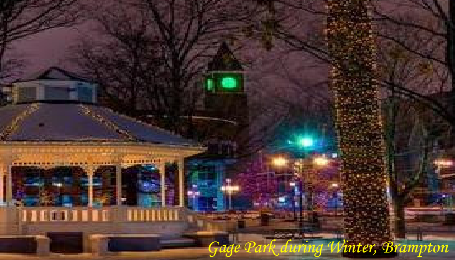
Gage Park during Winter, Brampton